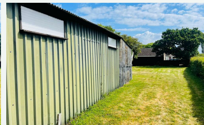
Land Adjoining Manorfields, Ningwood, Isle of Wight